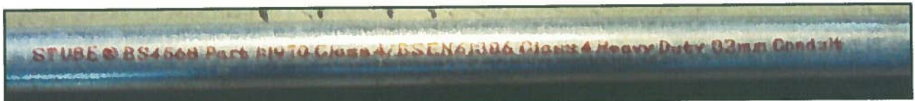
Sample as submitted

3 length and 6 bend samples each of nominal diameter 20mm, 25mm and 32mm steel conduit samples were submitted by United U-Li Impex Pte Ltd on 08 th July 2011 for testing.